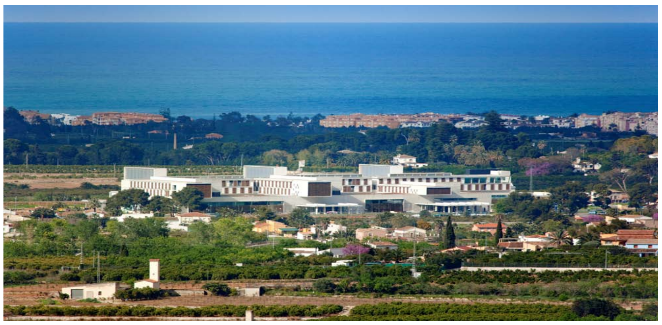
Hospital in Denia.

On 3 April the official ribbon was cut on the new hospital for the Marina Alta de Denia district, built by a joint venture featuring FCC Construcción, S.A.