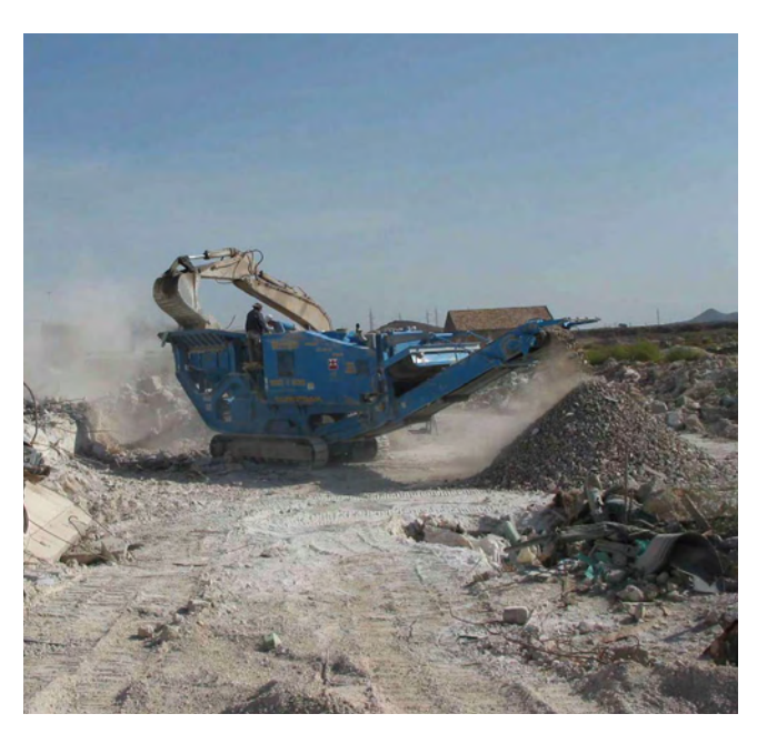
Demolition rubble will be made into aggregate for use as new raw materials.

This is a titanic task in which excellence, environmental friendliness and commitment to innovation come together within a context of cost reduction. When the work is viewed in perspective, one can see and appreciate that FCC Construcción has got a deep, sincere commitment to truly sustainable construction.