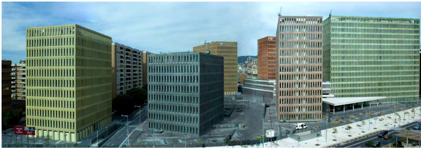
Barcelona's city of Justice.

The Government Council of Cataluña's regional government has entrusted to Urbicsa, which was created by FCC, FERROVIAL, OHL, COPISA and ENTE, the concession to build, maintain and operate the City of Justice for a 35-year period. This covers buildings D and J, which house retail space, a ground-floor shopping centre and offices for lease on the first to tenth storeys, plus the operation of the 1,600 parking spaces.