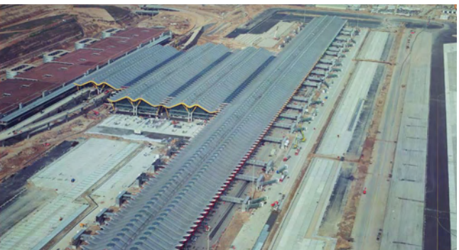
Aerial view of terminal T4 at Madrid-Barajas Airport in its final stage of

As part of the series, Jesús Gómez Hermoso, department head at FCC Construcción's Madrid Building II bureau, contributed two lectures, "The New T4 Terminal Building at Madrid-Barajas Airport: Construction Process" and "Skyscrapers: An Approach to Construction".