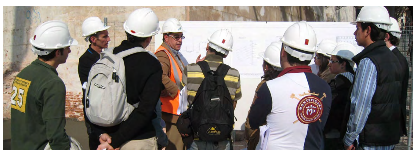
The students on their visit.

On 2 April the students in the master's degree programme in building, refurbishment and technical control at European University of Madrid's Advanced School of Building, who have got the cooperation of the A. Camuñas Foundation, visited the site where FCC Construcción is building the Museum of Royal Collections.