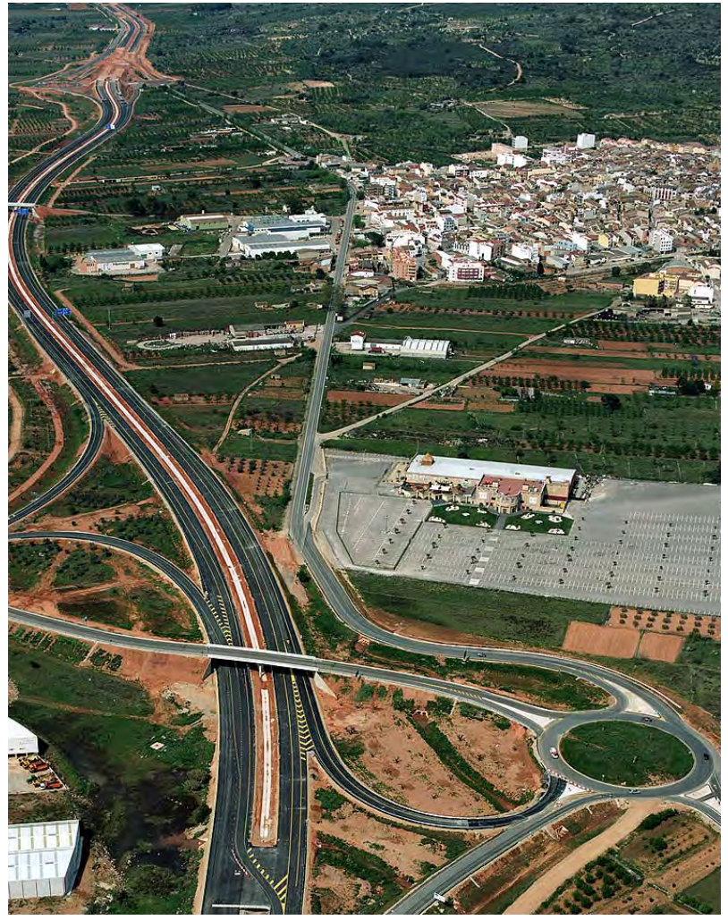
Aerial view of the Cabanes bypass.

The Cabanes bypass was opened to traffic on 15 April. The 11.7-kilometre-long section of road CV-10 between Pobla Tornesa and the intersection with road CV-152 (leading to Benlloch) has now been upgraded to dual carriageway format.