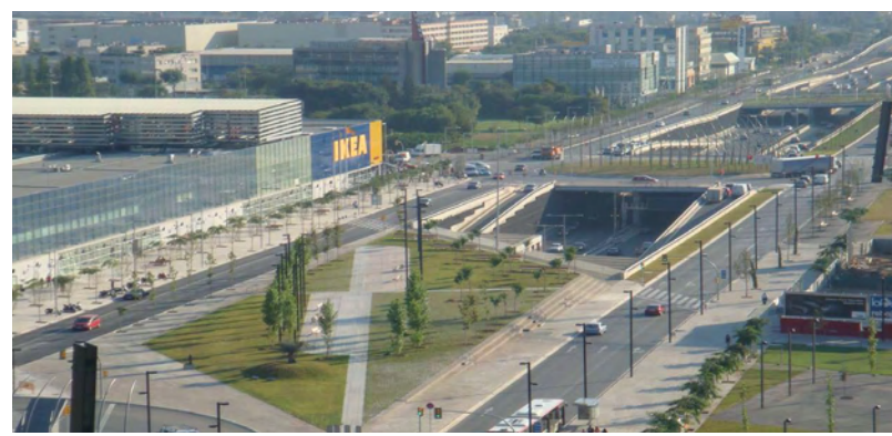
Vía and Plaza de Europa.

The construction and development of the Gran Via and Plaza Europa in L'Hospitalet was one of the big winners at the 2009 Construmat Awards given out on 22 April. The transformation of the Gran Via and the development of the adjacent land for planned uses have made this flank of the city of Barcelona more permeable. The jury chose to give this project the award in the civil-engineering category due to the magnificent job done in organising the land, the way the solution has improved openness to traffic, the complexity of the job (which necessitated a wide variety of construction techniques), the sobriety of the solution chosen and the multidisciplinary nature of the work.