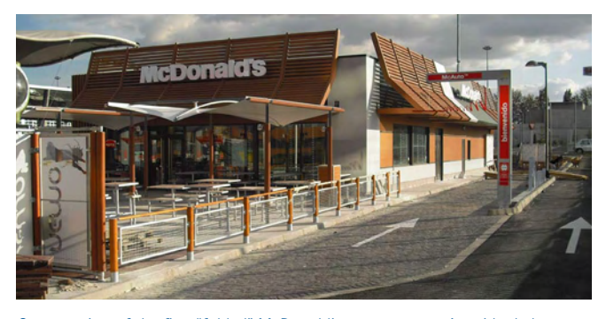
Construction of the first "folded" McDonald's restaurant on Avenida de los Poblados, Madrid.

So far Megaplas has manufactured and installed seven restaurants with this image, in Torrent, Alicante; Ronda de Bará, Tarragona; Las Tablas, Madrid; Avenida de los Poblados, Madrid; Igualada, Barcelona; Rubí, Barcelona; and Torrevieja, Alicante.