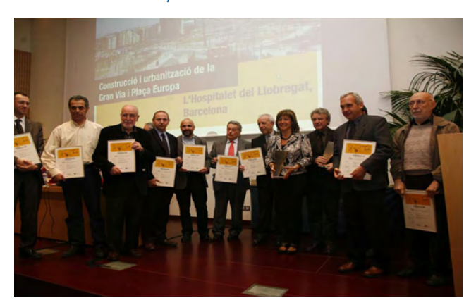
The team accepting their award.

Amadeu Torner-Fira, will act as an intermodal transfer facility in combination with the future Amadeu Torner station on line 9 of the Metro system.